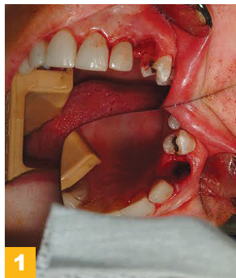
Figure 1: Caption 1: Periostome about to be inserted into the PDL space to 'incise' the ligament and separate root from socket

The first step in this delicate process is to separate the tooth root from the periodontal liga-