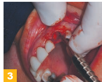
Figure 3: X-Trac forceps 'deliver' the root/tooth complex after the xotomes achieve coronal displacement with ease. Minimal purchase on this sectioned palatal root is securely grasped with narrow 'ribbed' forcep beaks.